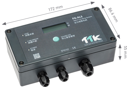
FG-ALS Wall Mounted Unit