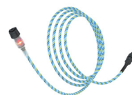
FG-EC addressable water leak detection cable with embedded microprocessor

Technology FG-NET Web Interface; FG-NET digital monitoring unit; FG-BBOX satellite devices; FG-EC and FG-ECS addressable water sensing cables; FG-ECP addressable point sensors