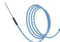
FG-ECS water leak detection cable