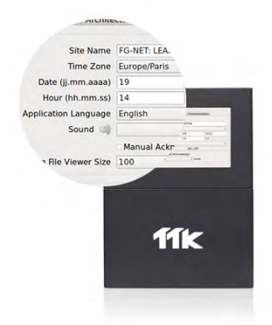
FG-NET panel: User-friendly interface of configuration