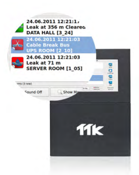
FG-NET panel: Simultaneous alarms displayed on one screen