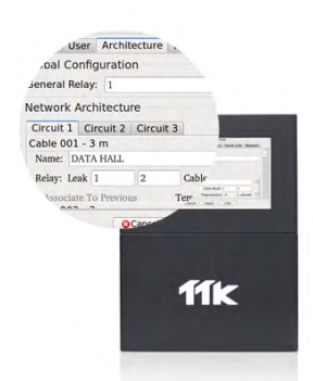
FG-NET panel: Easy setup of relays for each cable