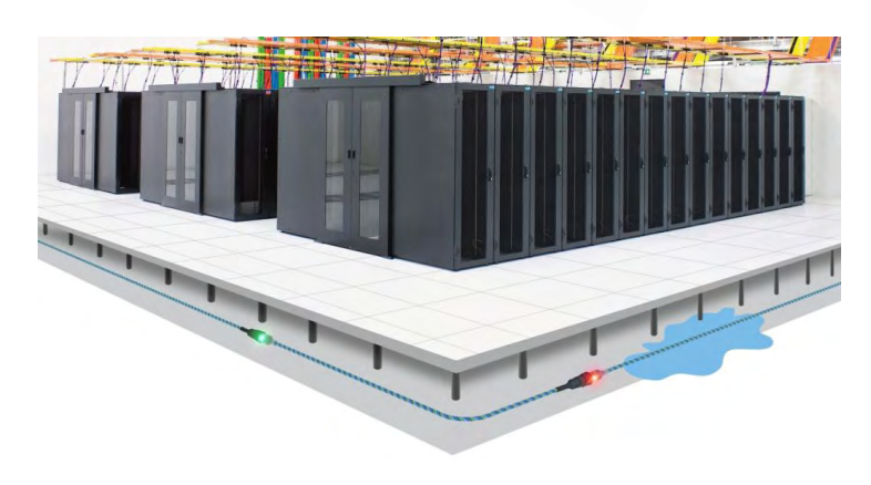
Typical Data Center false floor water sense cable installation example