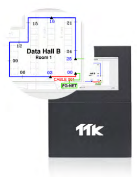
FG-NET panel: Dynamic map shows leak in real time