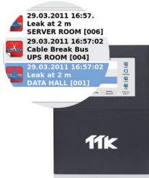
Simultaneous alarms displayed on one screen