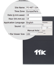
User-friendly interface of configuration