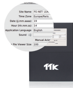
User-friendly interface of configuration