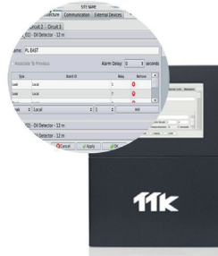
Easy setup of relays for each cable