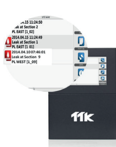
Simultaneous alarms displayed on one screen