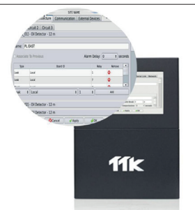
Easy setup of relays for each cable