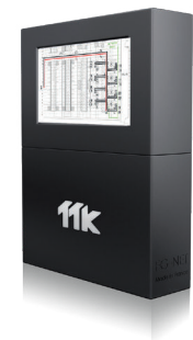
Digital monitoring unit FG-NET

This solution fully meets the client's technical and operational requirements. Given the performance of this installation, the same leak detection architecture is set to be progressively deployed across the client's upcoming phases at this and other sites.