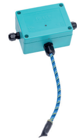
FG-ECP-L water point sensor

Water point sensors (FG-ECP, L-shape configuration) are deployed in confined areas where sense cables are not geometrically suited, ensuring no monitoring gap exists across the facility.